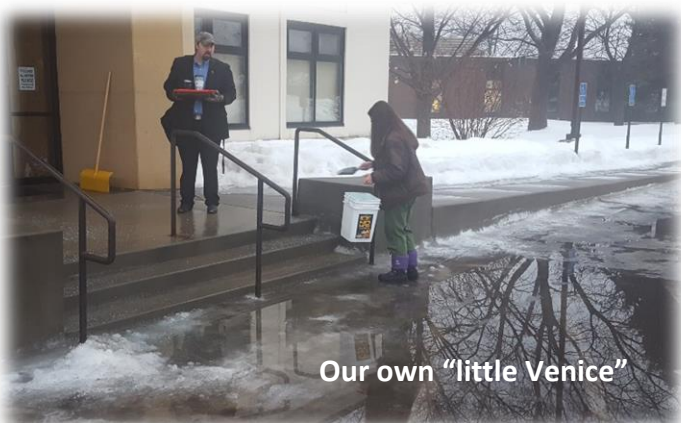
Our own “little Venice”